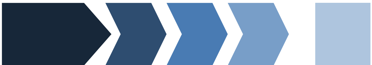
Blue with a hint of grey