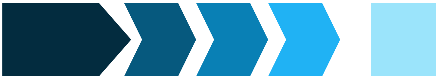
Blue with a hint of green